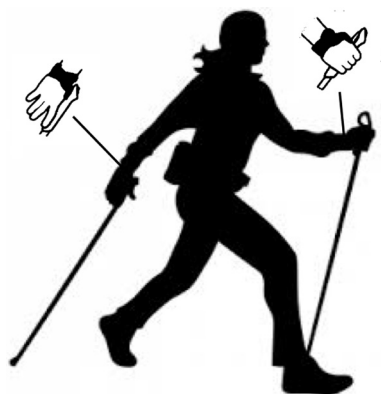
Fig. 1. Hands coordination scheme during Nordic Walking practice